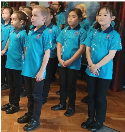
Primary – Music Dress Code

Secondary students: Black Kingsway music performance shirt (available at the uniform shop), black trousers or skirt, black socks or stockings and black shoes.