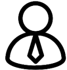
Primary School Office, Principal, Dean of Primary