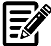
Write them a letter