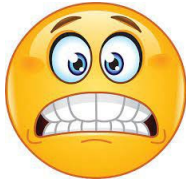
Scared or unsafe?